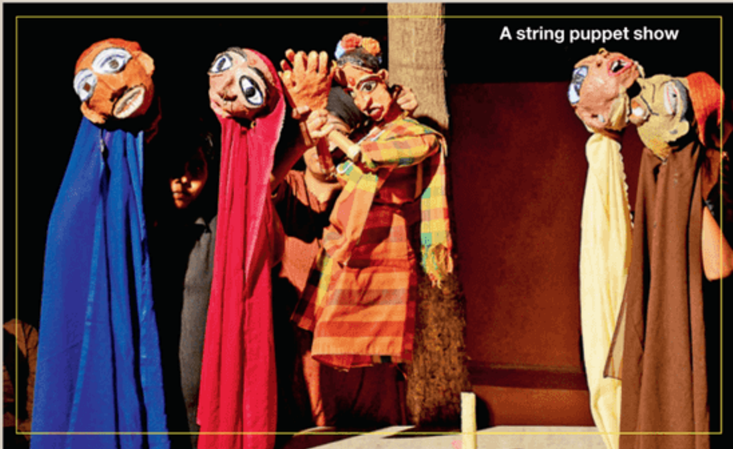
A string puppet show