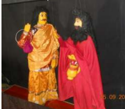
Assam Puppet Theatre Makhibaha, Nalbari

Photos from Assam Puppet Theatre Makhibaha, Nalbari