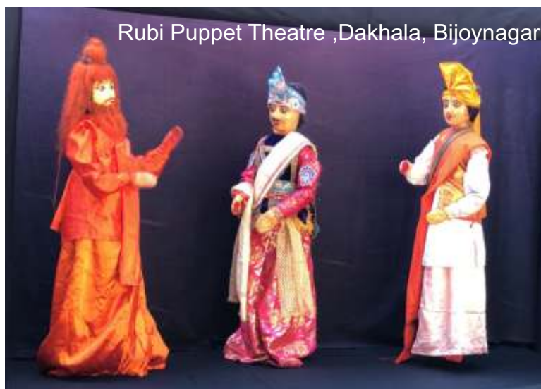
Rubi Puppet Theatre ,Dakhala, Bijoynagar

Puppetry in Assam is an age old tradition but it still holds an insignificant position in the arena of performing arts. Many scholars marginalize its importance by terming puppetry as a "child's play"(Dutta, 1986), when we